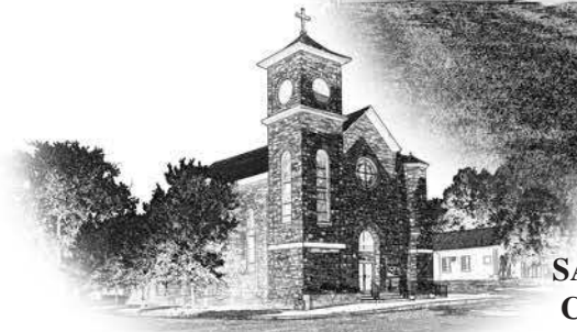
SACRED HEART CHURCH Warsaw

We the Hancock County Catholic Churches, work together to form disciples of Jesus, to lead all to Him in the Eucharist, and to be His presence in the world.