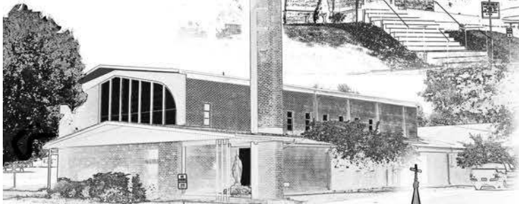
SAINT MARY CHURCH Hamilton