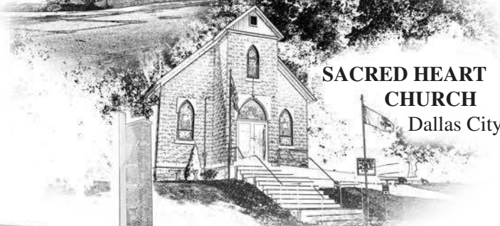
SACRED HEART CHURCH Dallas City