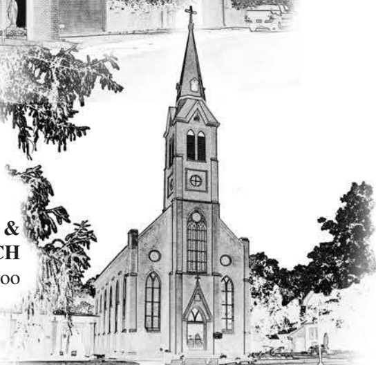
SAINTS PETER & PAUL CHURCH Nauvoo