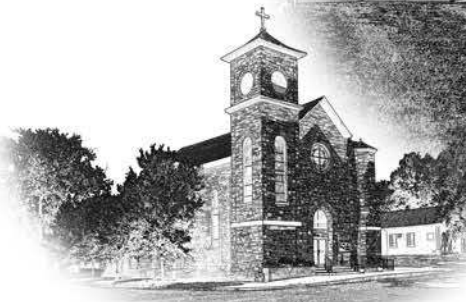
SACRED HEART CHURCH Warsaw

We the Hancock County Catholic Churches, work together to form disciples of Jesus, to lead all to Him in the Eucharist, and to be His presence in the world.