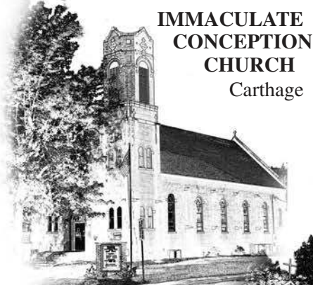
IMMACULATE CONCEPTION CHURCH Carthage