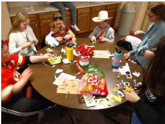
Youth Group at 3 p.m. every 2nd and 4th Thursday!

Blessed Sacrament offers Adoration every Wednesday from 8:30 a.m. to 5:10 p.m! Jesus is waiting for you.