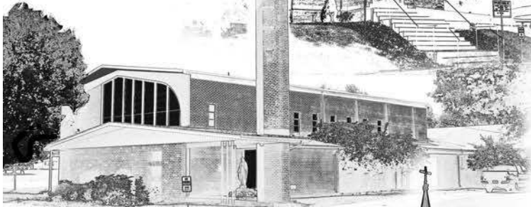
SAINT MARY CHURCH Hamilton