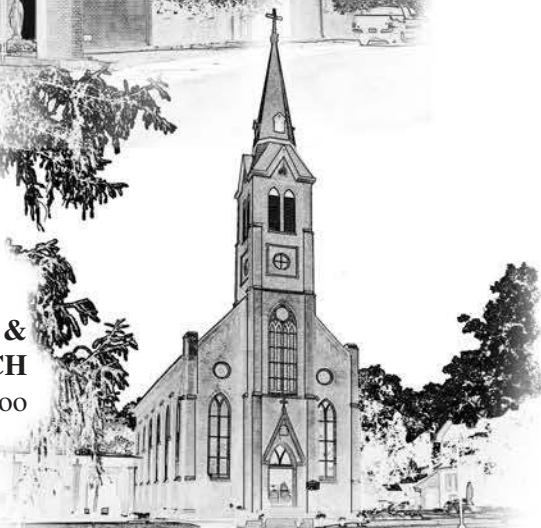
SAINTS PETER & PAUL CHURCH Nauvoo