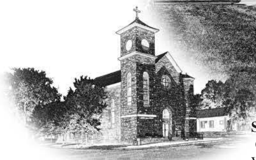
SACRED HEART CHURCH Warsaw

We the Hancock County Catholic Churches, work together to form disciples of Jesus, to lead all to Him in the Eucharist, and to be His presence in the world.