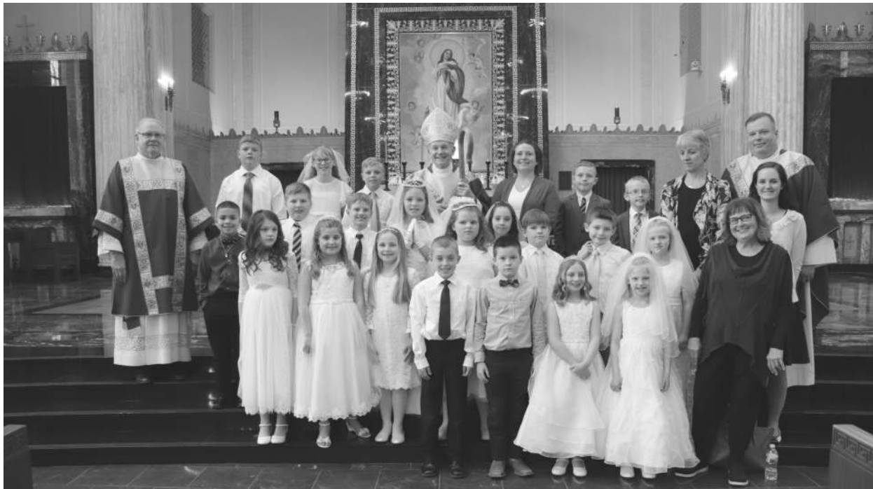
Congratulations to our First Communicants and Confirmandi!!

Bridge the Gap to Health was founded on the premise that the definition of health includes physical, mental, and spiritual practices.