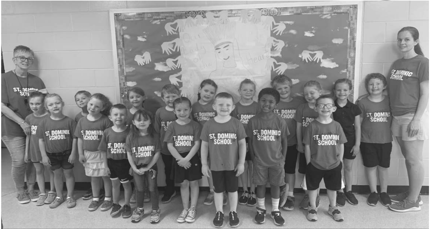
Kindergarten Leaders — Our Lady with the Golden Heart