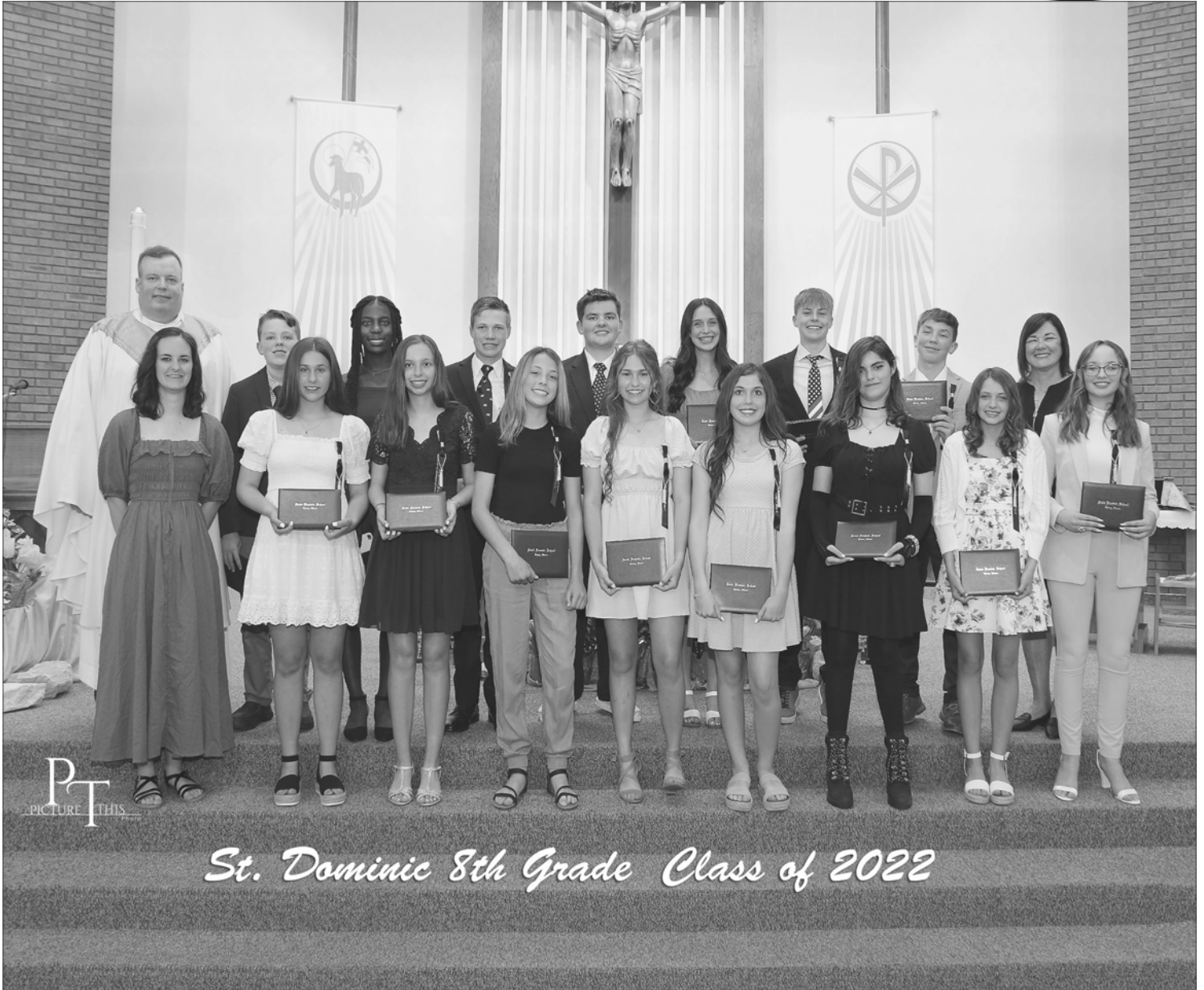
St. Dominic 8th Grade Class of 2022

Congratulations to our outstanding Class of 2022 on meeting the requirements of graduation. St. Dominic School of St. Anthony of Padua Parish is a dedicated Catholic school, where Holy Moments happen every day. Our graduates have experienced many Holy Moments, which happen when you put aside your self-interests and do what God is calling you to do. We pray that they will continue to be blessed with many Holy Moments because these graduates will choose to share their time, talents, and treasure, and listen to what the Holy Spirit calls them to do. We trust that the knowledge, skills, faith, and friendships they have developed during their years at St. Dominic School help them along their life's journey. We hope that as they leave St. Dominic, each one of them takes many special memories of their grade school years. In the coming years, may God grant them many blessings and keep them safe the rest of their life. Our doors will always be open to our new alumni so please come visit.