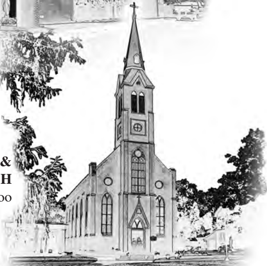
SAINTS PETER & PAUL CHURCH Nauvoo