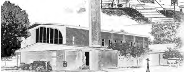
SAINT MARY CHURCH Hamilton