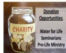
Donation Opportunities: Water for Life Seminarians Pro-Life Ministry

Share Table: Feel free to bring items you no longer want, but others might love!