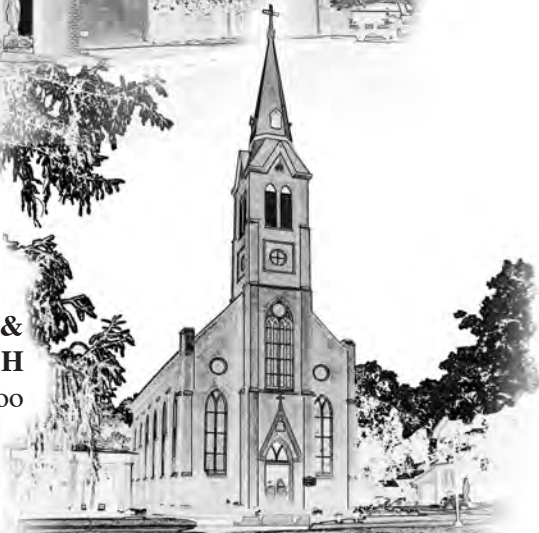
SAINTS PETER & PAUL CHURCH Nauvoo