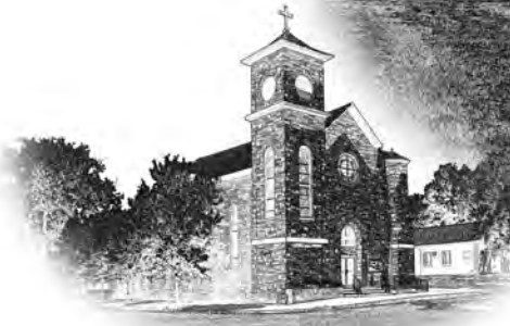
SACRED HEART CHURCH Warsaw

We the Hancock County Catholic Churches, work together to form disciples of Jesus, to lead all to Him in the Eucharist, and to be His presence in the world.