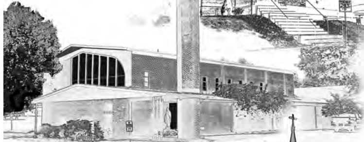
SAINT MARY CHURCH Hamilton