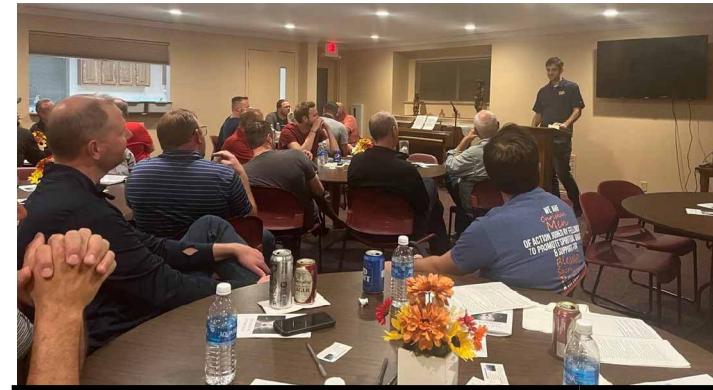
Thank you to all who joined us for the Men's Conferences: God of Miracles

All are invited to come and pray for our Priests!