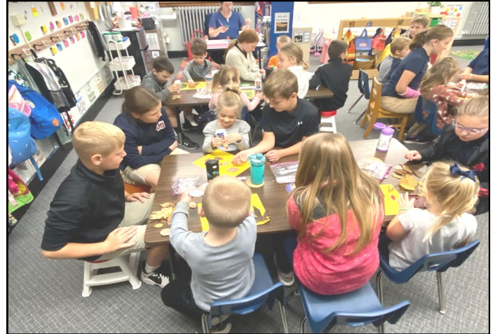
This year each grade level has a partner class with another grade level. Sometimes they do activities together. Here fifth graders are helping preschoolers with a leaf collage.