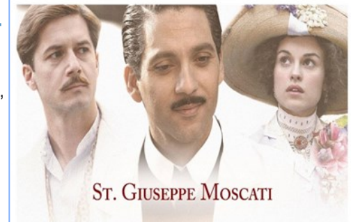
ST. GIUSEPPE MOSCATI