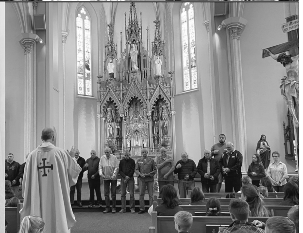
Blessing our Veterans