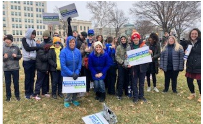
Students and parishioners from ICCC and QHR attended the Ignite For Life rally and march in Topeka on January