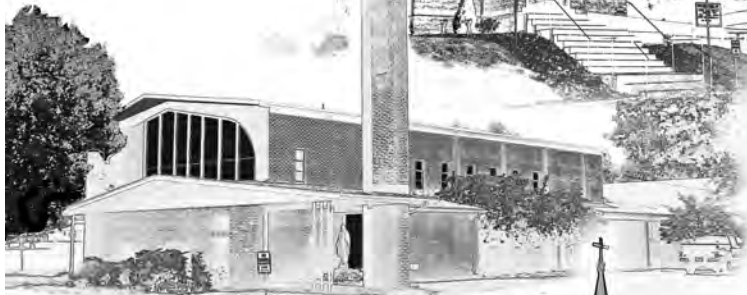
SAINT MARY CHURCH Hamilton