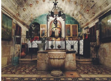
Jacob's well, housed in the Orthodox church of St. Photinus in the modern city of Nablus in Israel.

The next three weekends of Lent, we hear a series of stories from the Gospel of John. The First story is the Samaritan Woman at the Well. She was searching not only for some water, but for some clarity in her life. She had been married a number of times, but had not found a stable relationship in her life. Jesus approaches her as a supernatural suitor, one who is vying not simply for her affections, but for a supernatural love which she herself was perhaps not aware of.