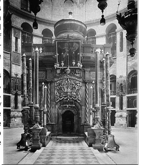
The 'Edicule' ('little house') standing over the site of Jesus' tomb in Jerusalem, inside the Church of the Holy Sepulcher.