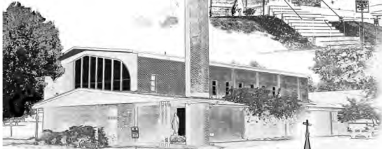
SAINT MARY CHURCH Hamilton