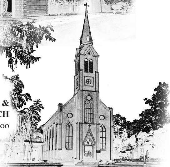
SAINTS PETER & PAUL CHURCH Nauvoo