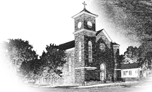
SACRED HEART CHURCH Warsaw

We the Hancock County Catholic Churches, work together to form disciples of Jesus, to lead all to Him in the Eucharist, and to be His presence in the world.