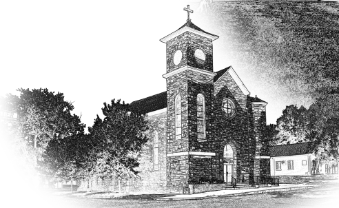
SACRED HEART CHURCH Warsaw

We the Hancock County Catholic Churches, work together to form disciples of Jesus, to lead all to Him in the Eucharist, and to be His presence in the world.