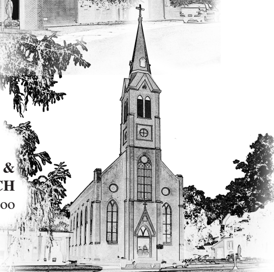
SAINTS PETER & PAUL CHURCH Nauvoo