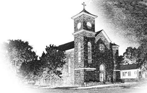
SACRED HEART CHURCH Warsaw

We the Hancock County Catholic Churches, work together to form disciples of Jesus, to lead all to Him in the Eucharist, and to be His presence in the world.