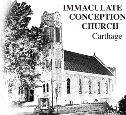
IMMACULATE CONCEPTION CHURCH Carthage