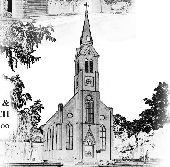
SAINTS PETER & PAUL CHURCH Nauvoo