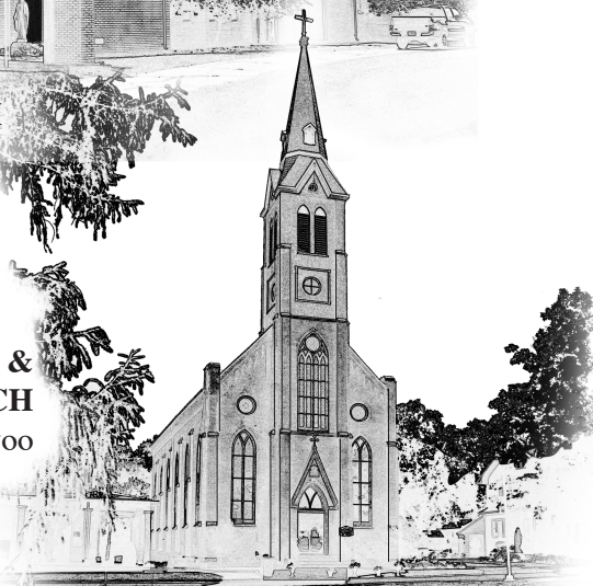
SAINTS PETER & PAUL CHURCH Nauvoo