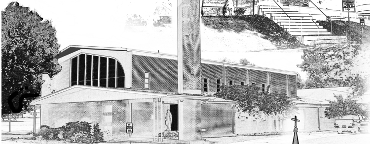
SAINT MARY CHURCH Hamilton