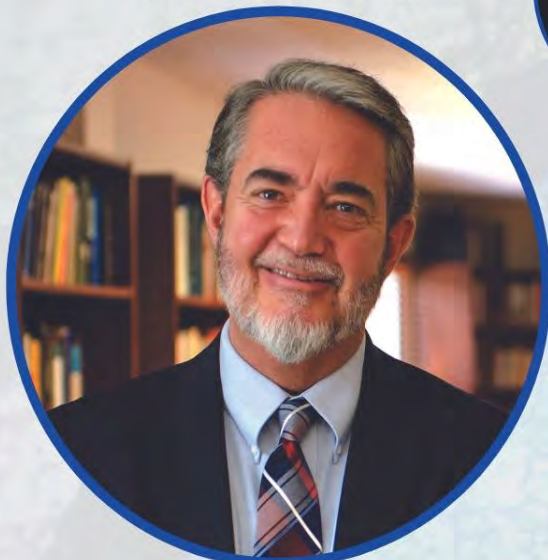
Keynote Dr. Scott Hahn

For details, speaker bios, and schedule - visit dio.org/revival-bos