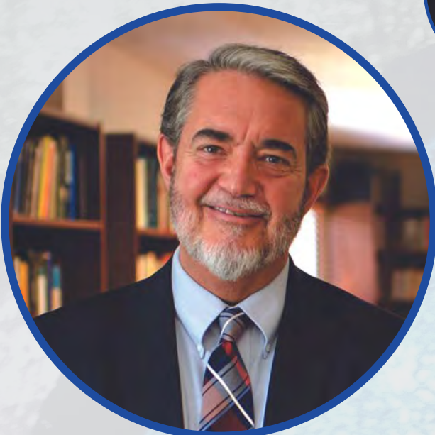
Keynote Dr. Scott Hahn

For details, speaker bios, and schedule - visit dio.org/revival-bos