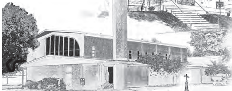
SAINT MARY CHURCH Hamilton