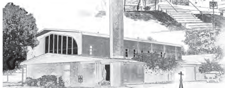
SAINT MARY CHURCH Hamilton