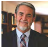
Keynote: Dr. Scott Hahn

The Diocesan Eucharistic Congress will include nationally recognized Catholic speakers, adoration, confession, and Mass. For details, speaker bios, and schedule, visit dio.org/revival-bos .