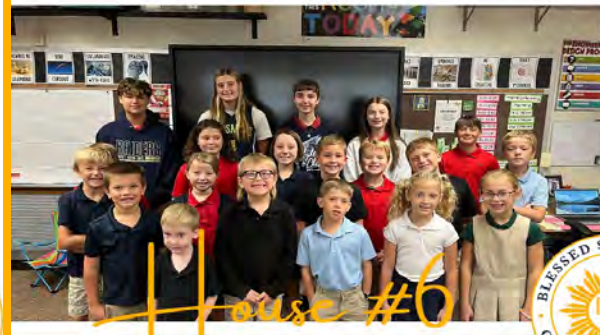
House #6 BLESSSED CARLO ACUTIS