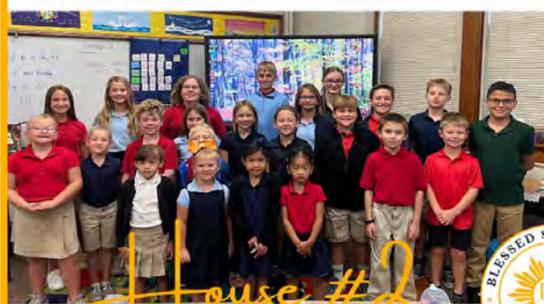
House #2 POPE ST. JOHN PAUL II