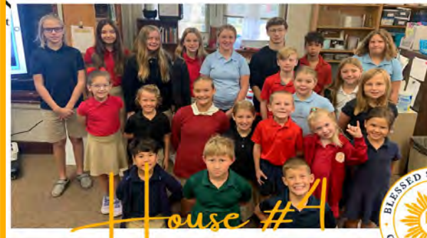
House #4 ST. ELIZABETH ANN SETON