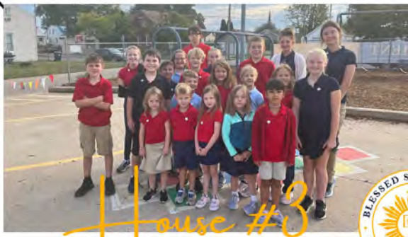
House #3 VEN. AUGUSTUS TOLTON