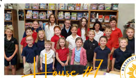
House #7 ST. ANTHONY