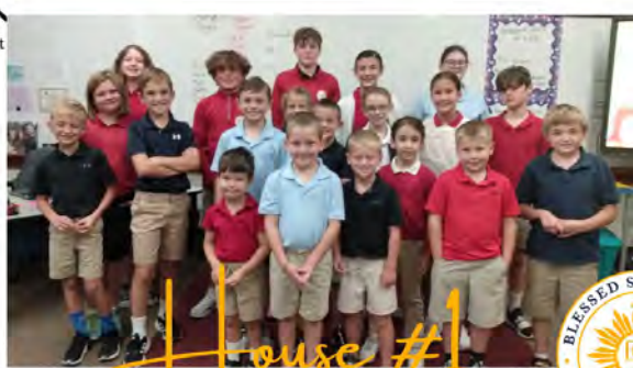
House #1 ST. KATERI TEKAWITHA