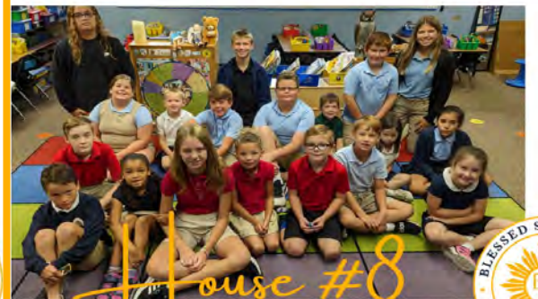
House #8 ST. MARY