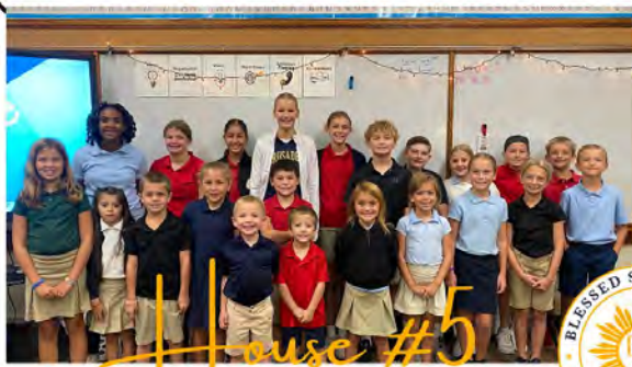
House #5 ST. FAUSTINA KOWALSKA