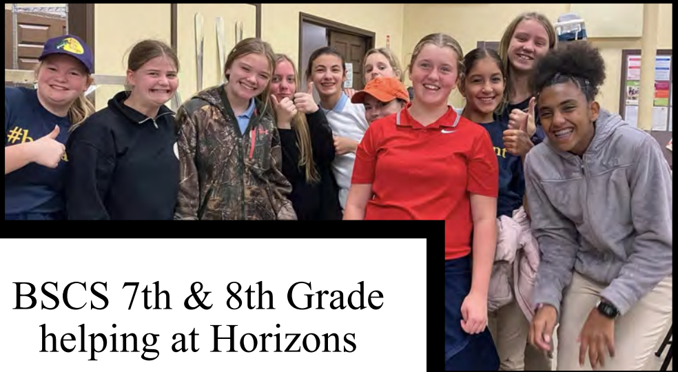
BSCS 7th & 8th Grade helping at Horizons