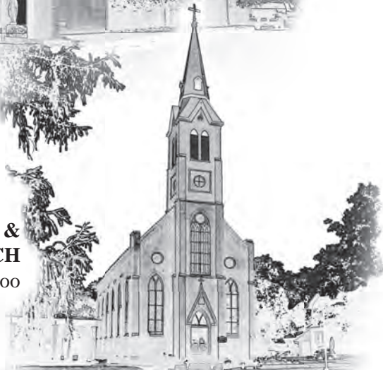
SACRED HEART CHURCH Warsaw

We the Hancock County Catholic Churches, work together to form disciples of Jesus, to lead all to Him in the Eucharist, and to be His presence in the world.