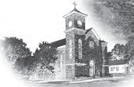
SACRED HEART CHURCH Warsaw

We the Hancock County Catholic Churches, work together to form disciples of Jesus, to lead all to Him in the Eucharist, and to be His presence in the world.