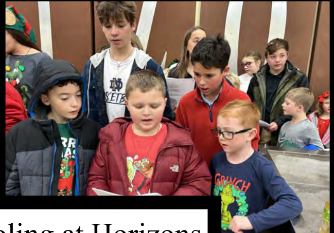
BSCS caroling at Horizons December 2023