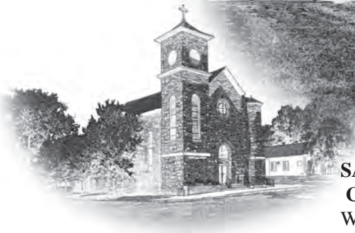
SACRED HEART CHURCH Warsaw

We the Hancock County Catholic Churches, work together to form disciples of Jesus, to lead all to Him in the Eucharist, and to be His presence in the world.