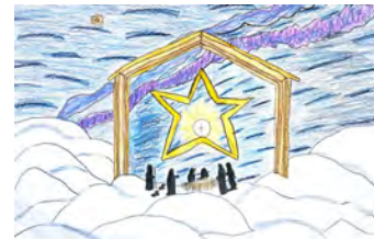
Age 11-14: Emelyn Little