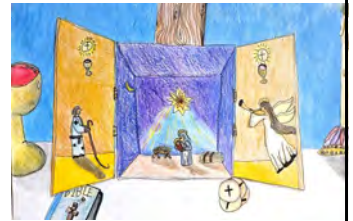
Age 8-10: Bridget Little