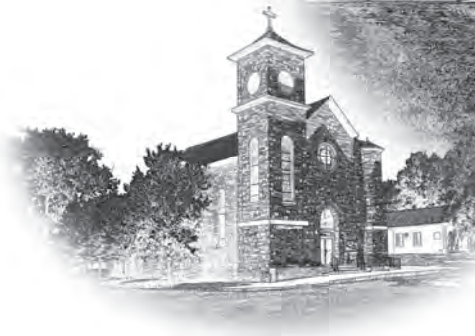
SACRED HEART CHURCH Warsaw

We the Hancock County Catholic Churches, work together to form disciples of Jesus, to lead all to Him in the Eucharist, and to be His presence in the world.