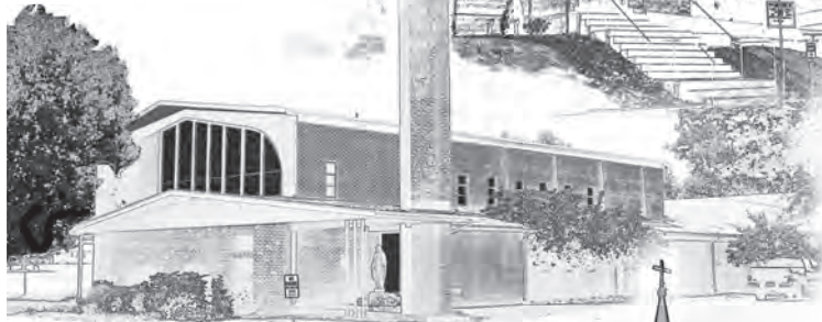
SAINT MARY CHURCH Hamilton