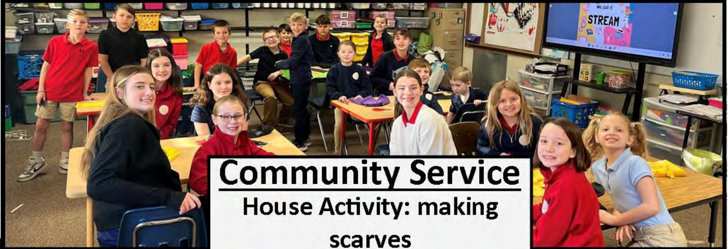
Community Service House Activity: making scarves