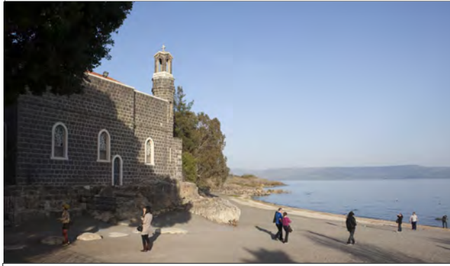
Church of the Primacy of St. Peter, on the shore of the Sea of Galilee, Tabgha, Israel

Jesus says, “Thus it is written that the Christ would suffer and rise from the dead on the third day and that repentance, for the forgiveness of sins, would be preached in his name to all nations, beginning in Jerusalem. You are witnesses of these things.” (Luke 2: 45-48)