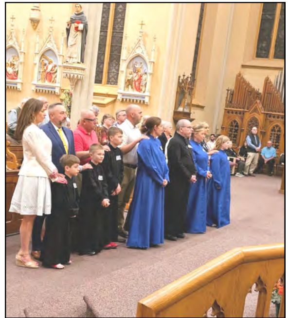
Pictured are the newest members of the Catholic faith with their sponsors and godparents who were initiated at the Easter Vigil Mass March 30 at St. Francis.

You should have received a packet in the mail explaining more about the campaign and our plans. If you haven't received your packet, please let the parish office know and we'll send one out to you. The packet explains more about our campaign, in which we are looking to raise $1.6 million for repairs and updates to the current parish campus. This includes repairing our Clock Tower, updating various systems in our church, parish center and rectory, providing more green spaces for our Catholic School children and replenishing our parish savings account. This weekend, pledge cards are available at this Mass. If you have not had an opportunity to turn in your pledge, please do so by mailing it to the office, dropping it off at the office or dropping it in the offertory basket. Thank you!