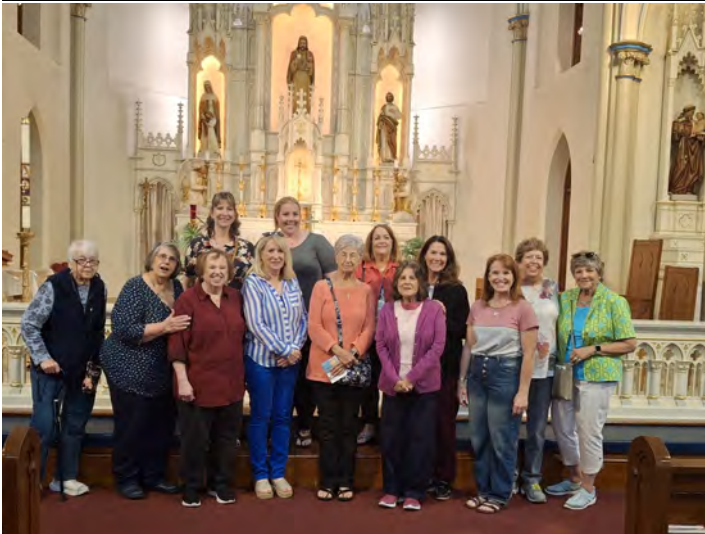
Altar Society Field Trip; Blessed Sacrament Catholic Church

Baptism Training Class ~ The next Baptism training class will be held on Sunday, June 9 at 9:00 a.m. It will be held in the office building's dining room. Please pre-register with the office to let us know you will be attending this session.