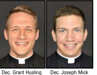
serve and follow God's will as newly ordained deacons and priests!