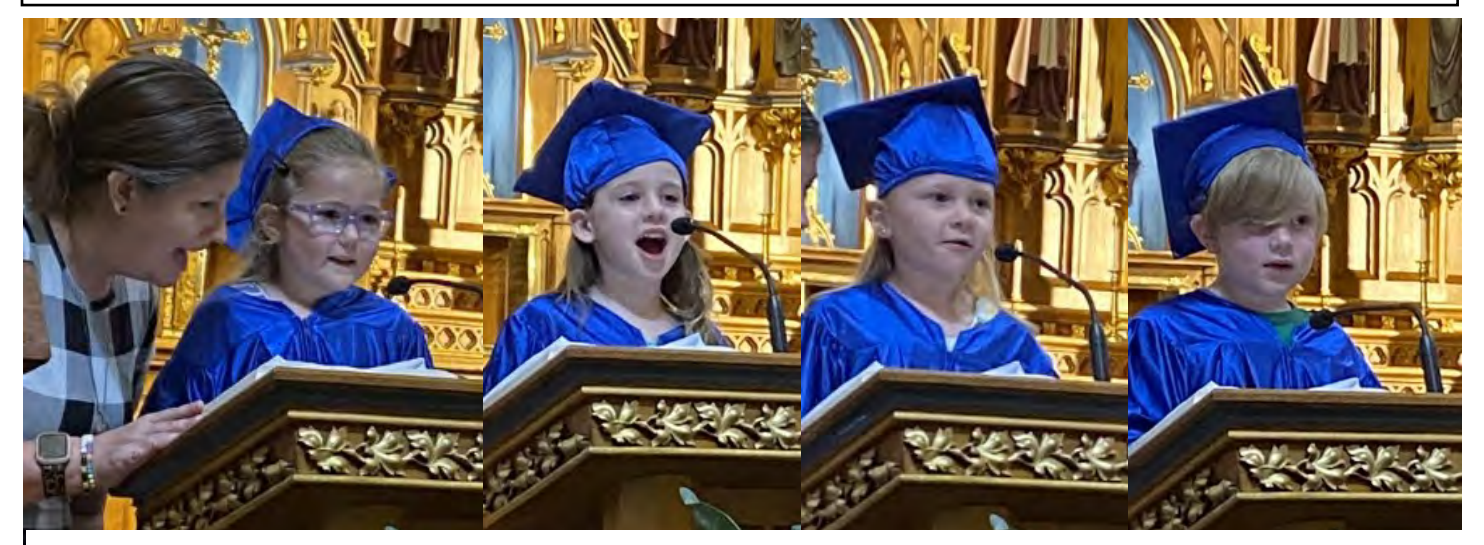
2024 Preschool Graduation