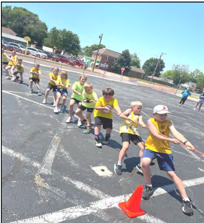
Students in kindergarten through fourth grade took part in an Olympic Day at school May 20.