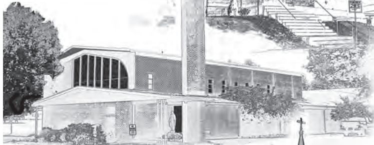
SAINT MARY CHURCH Hamilton