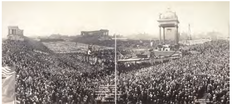
The XXVIII International Eucharistic Congress gathers at Soldier Field in Chicago, with nearly 400,000 in attendance. (June 1926)

This weekend, nearly 50,000 have gathered for the 10th National Eucharistic Congress in Indianapolis. This is the culmination of years of planning, which ultimately is targeted at inviting the entire Church to renew its devotion to the Holy Eucharist. While this event is taking place hours from here, we are all united in spirit through the Eucharist we share. Heaven and earth are joined each time we call upon the presence of our Lord at Mass. He wishes to feed us with his own flesh as we recognize him as Lord. God is not a far-away reality, but one who speaks to the hunger of our souls inviting us to eat, drink, and live!